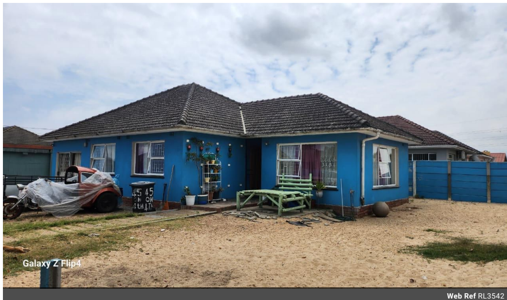
Galaxy Z Flip4